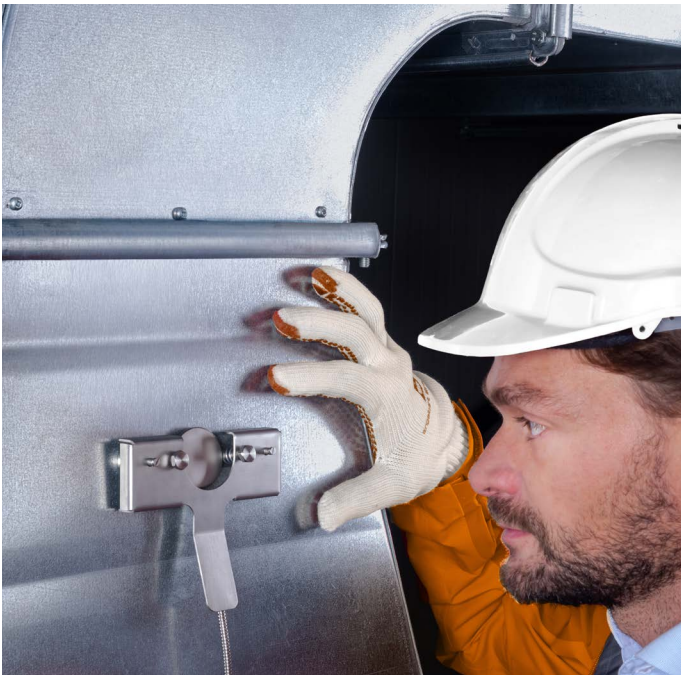
Figure 2 Verification of thermal behavior of industrial equipment with the very robust IHF02 sensor. Here on a frame with magnets for surveying.