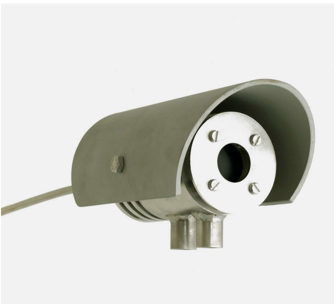
Figure 4 HF02 flare radiation monitor/heat flux sensor as used in permanent installation; EN (EExi) certified.

Products are manufactured under ISO 9001 quality management system. If applicable, the sensors comply with industrial standards such as ITS90, ANSI, DIN, and BS. Sensors for hazardous areas can be manufactured according to safety standards like EExi, ATEX / Cenelec and NAMUR.