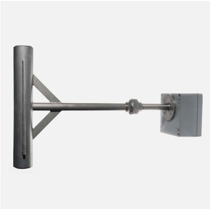
Figure 6 CBW01 heat flux sensor on a steam pipe. The sensor is located in the weld material at the crown of the tube. Typical use is in coal fired boilers and solar concentrators. Wiring is led away in the vertical tube to a connection box through the boiler insulation material. CBW01 is ASME certified.