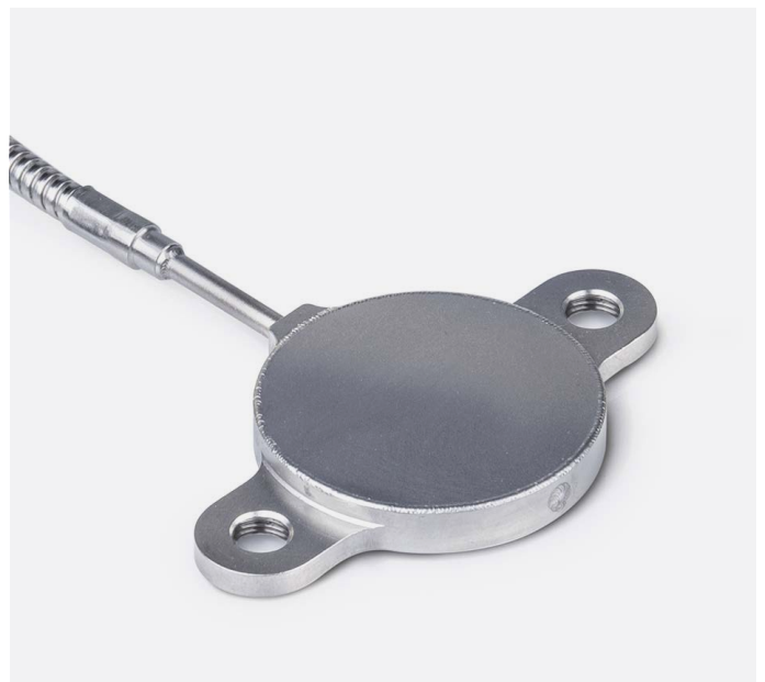
Figure 5 Ultra-sensitive heat flux sensor IHF02 for verification of thermal behavior of industrial equipment.