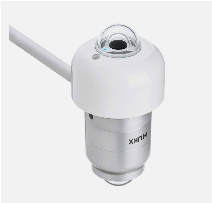
Figure 2 2 x SR300 spectrally flat Class A (secondary standard) pyranometers connected to a fixture plus rod, together forming an albedometer. The downfacing pyranometer is equipped with a glare screen to block solar radiation entering the lower detector at low solar angles (150 ° instead of 180 ° full field of view angle).