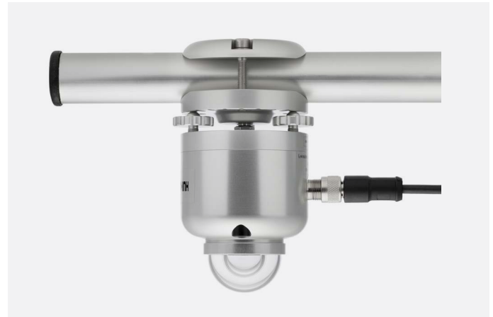
Figure 4 The tube mounts of SR30, SR15, and SR05 can be used to measure global, reflected, and Plane Of Array irradiance. For downfacing instruments, we typically do not use the sun screen. See also Figure 1.

Hukx pyranometer model SR30 is compatible with the requirements of Class A monitoring systems.