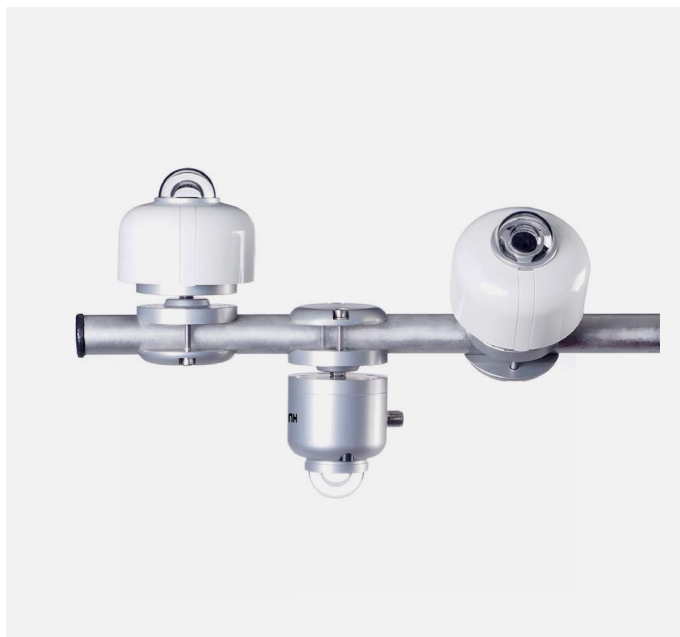
Figure 1 In PV system performance monitoring, users typically employ Plane of Array (POA) on the right, Global Horizontal Irradiance (GHI) on the left, and increasingly also Reflected Irradiance (RI) in the middle.

Albedo, also called solar reflectance, is defined as the ratio of reflected to global radiation. It is a dimensionless number less than 1 and a property of the ground surface.