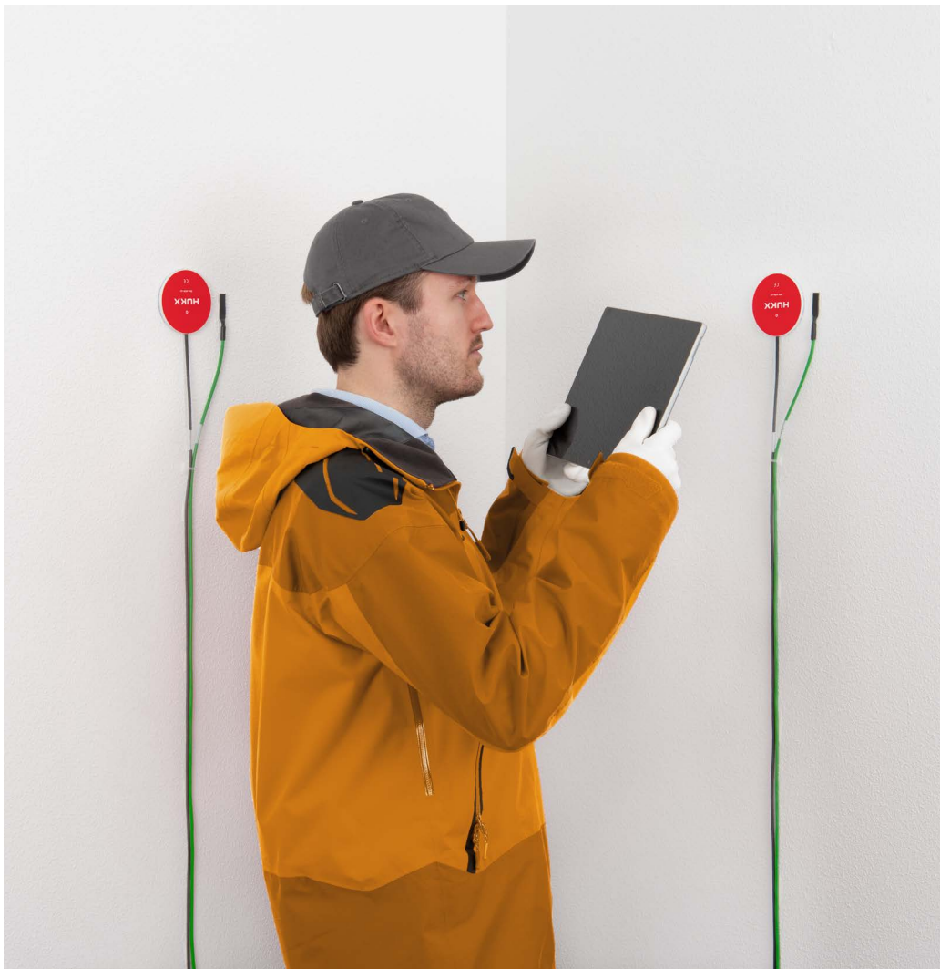
Figure 2 HFP01 heat flux sensor and thermocouples mounted on a wall.

TRSYS20 consists of two HFP01 heat flux sensors, two matched thermocouple pairs, a measurement and control unit (MCU), a power supply unit (PSU) and a carrying case. The high-sensitivity heat flux sensors in combination with the MCU's high-resolution electronics ensure that TRSYS20 continues to make meaningful measurements down to very low heat fluxes. The matched thermocouple pairs in TRSYS20 measure temperature differences across the wall with an uncertainty of better than 0.1^\circ C over the entire rated operating temperature range as required by ISO 9869 (paragraph 5.2).