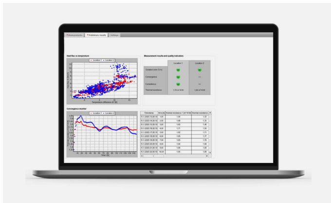
Figure 3 TRSYS20 graphical user interface, accessible through a web browser.