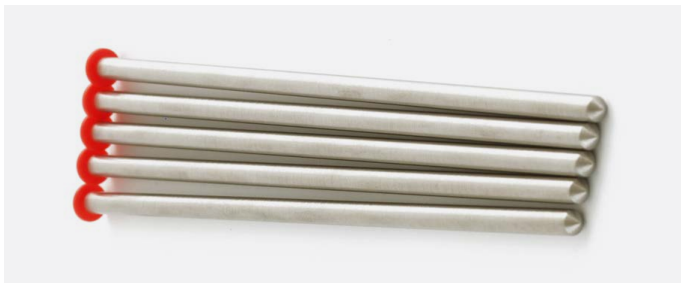
Figure 5 GT03: guiding tubes for use with TNS02