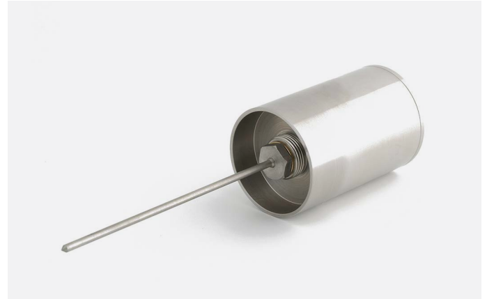
Figure 3 TNS02: Thermal needle TP07 with insertion tool IT03 for laboratory analysis of soil specimens. TP09 and lance LN02 are used for on-site measurements.