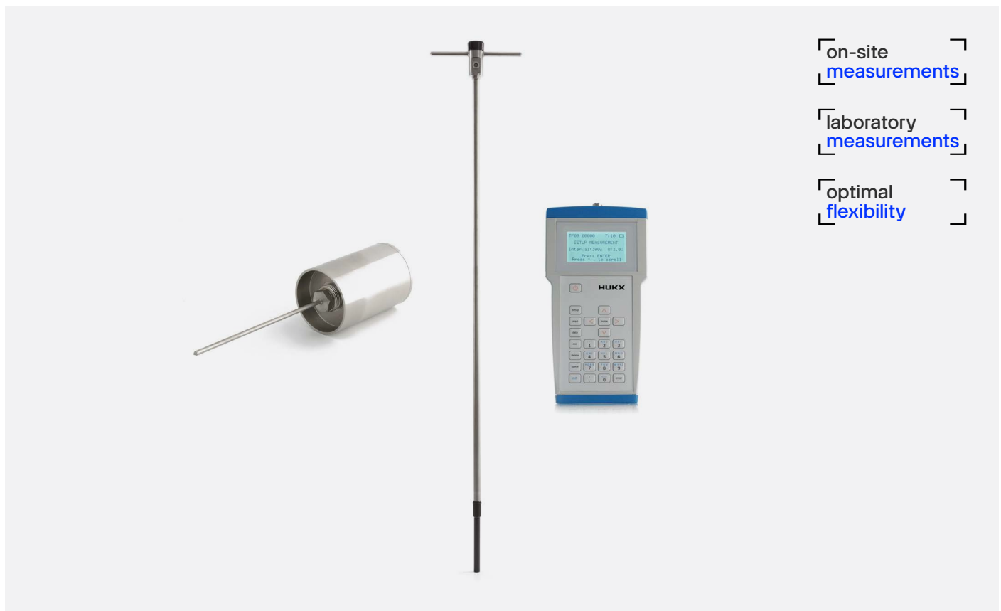
Figure 1 TNS02 thermal needles set.

Applicable standards are IEEE Guide for Soil Thermal Resistivity Measurements (IEEE Standard 442-1981(03)) and ASTM D5334-14 Standard Test Method for Determination of Thermal Conductivity of Soil and Soft Rock.