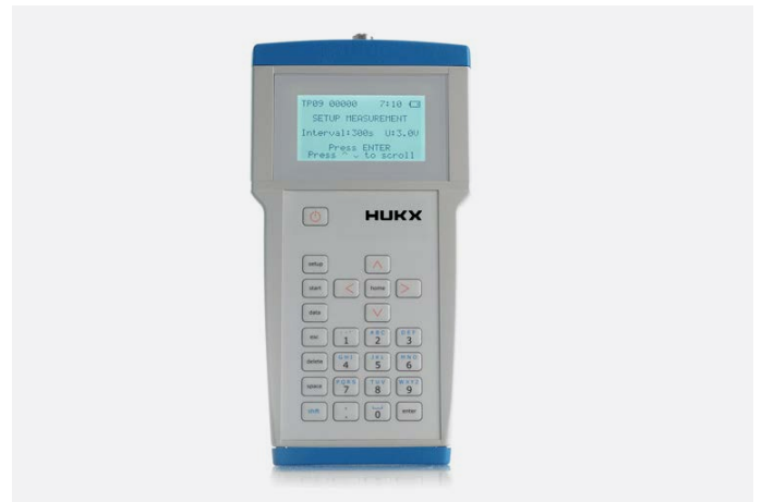
Figure 4 TNS02: CRU02 allows users to control the measurement using the keyboard and LCD display. Results are stored in CRU02's memory.