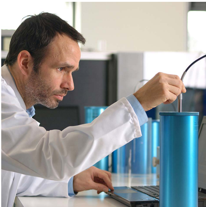
Figure 6 A calibration reference cylinder type CRC05 for needle calibration. The CRC05 is not included in the standard TNS02. For TNS02 two cylinders are required: CRC04 and CRC05.