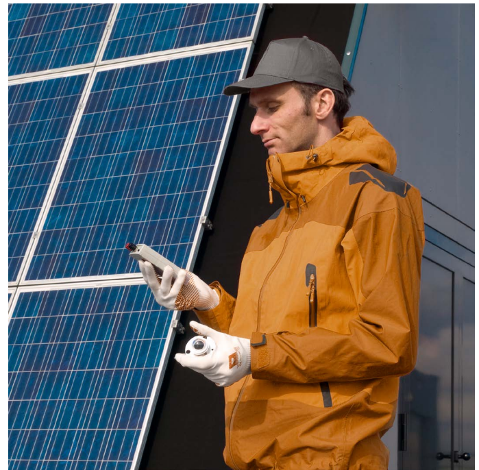
Figure 4 LI19 paired with a pyranometer in a field measurement campaign.

The latest software can be downloaded here .