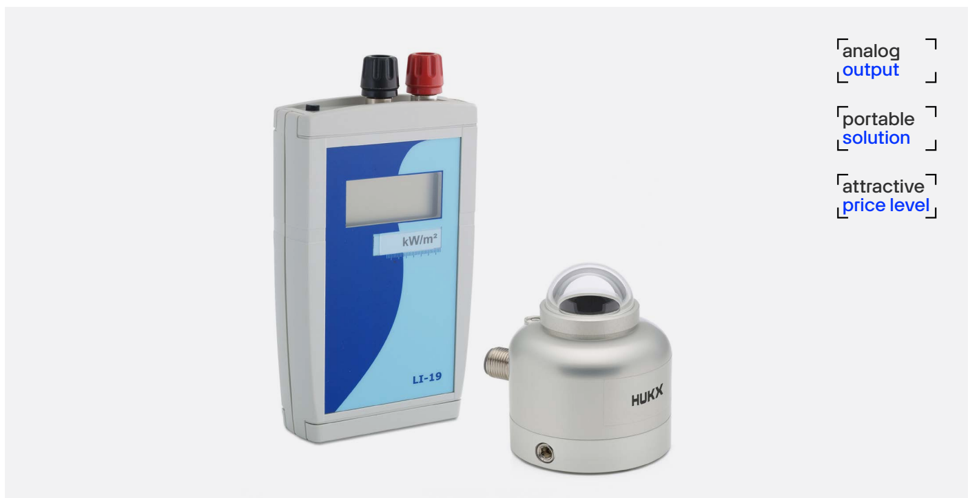
Figure 1 SR05-A1 pyranometer (right) with LI19 handheld read-out unit/data logger (left).

LI19 is a high-accuracy, handheld read-out unit/data logger that displays measured radiation data in real-time and stores it. Once programmed with the sensitivity of SR05 through its PC user interface, the display will automatically show the actual value of the solar radiation in W/m^2 .