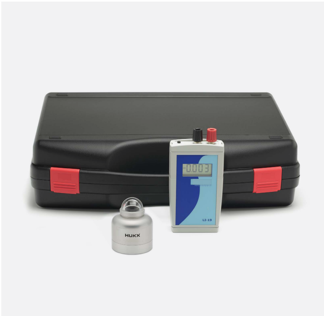
Figure 2 SR05-LI19 as it is delivered, in a practical transport case for portability and protection.