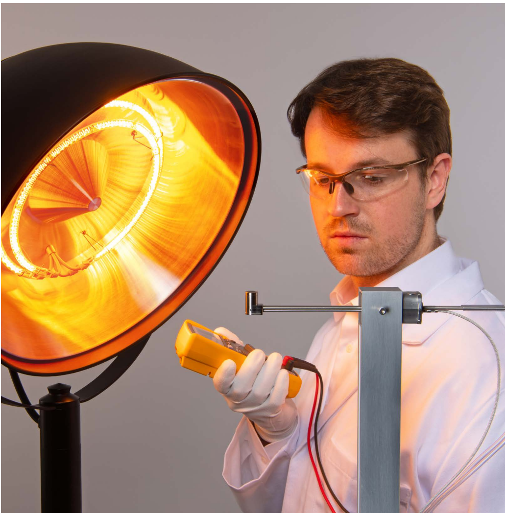
Figure 2 SBG04 is the sensor of choice for cone calorimeter calibration.