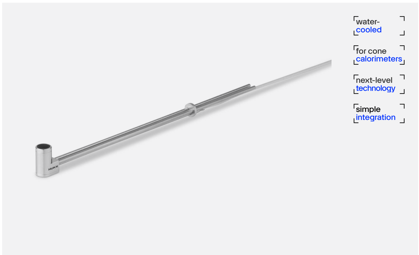
Figure 1 SBG04 water-cooled heat flux sensor.

These tubes stand at a 90° angle to the 0.5 inch diameter cylindrical sensor body axis, and parallel to the black sensor surface—as required for testing with cone calorimeters.