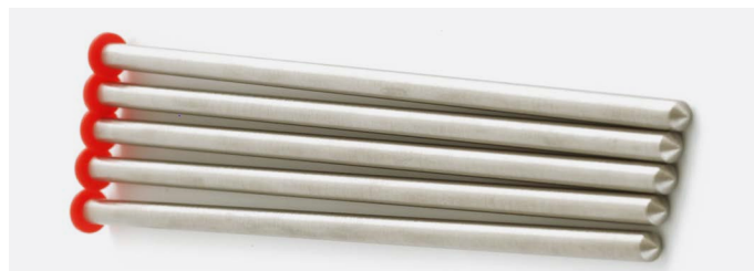
Figure 2 GT03 guiding tubes (not included)

Suitable for (on-site) field measurements: provided that the soil is relatively soft, MTN02 may be used for field measurements. In case of harder soils or measurements at greater depths we recommend use of stronger needles and a lance (like in the system FTN02 ), or guiding tubes (see below). MTN02 performs measurements as a stand-alone unit.