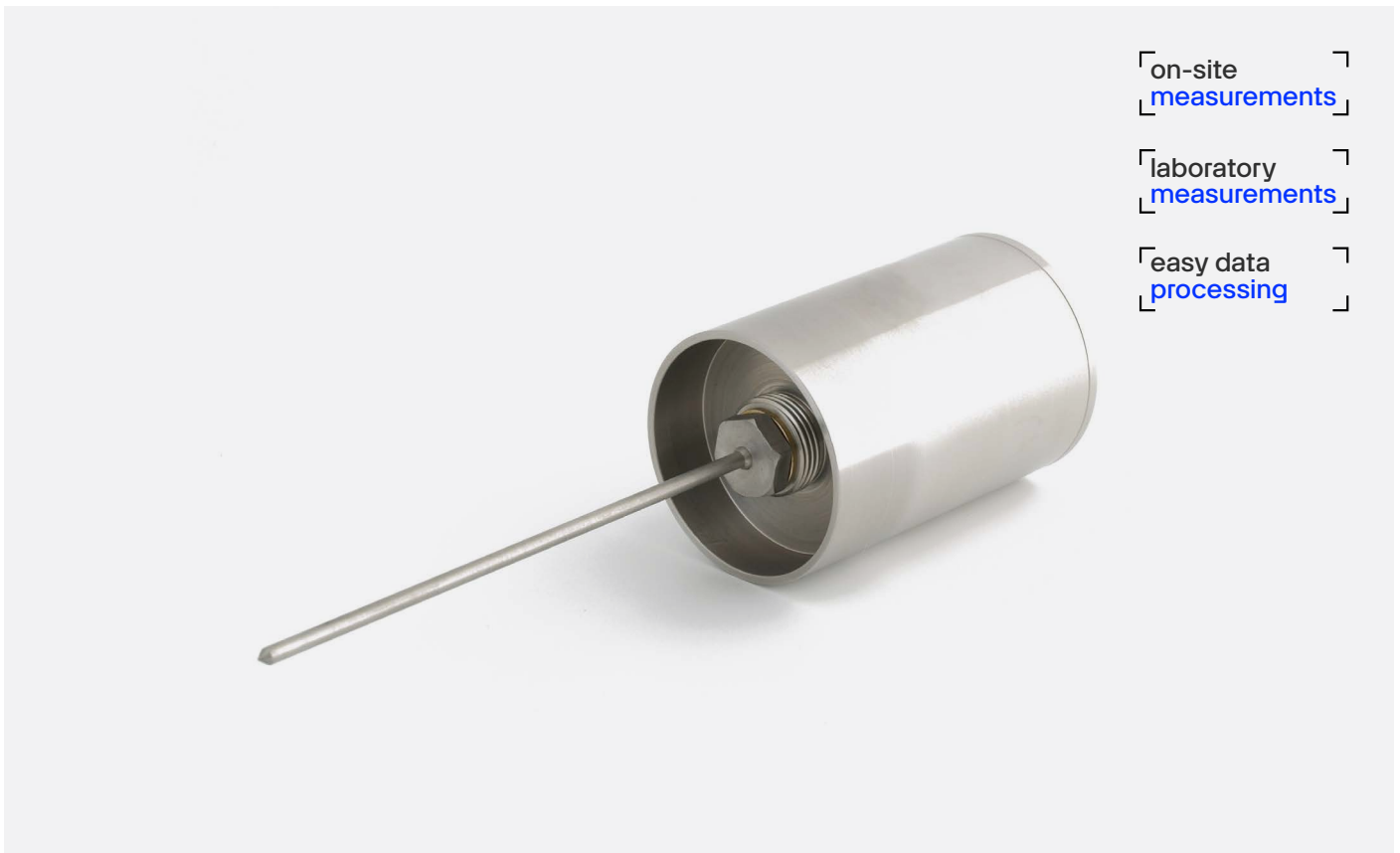
Figure 1 MTN02: Mounted on insertion tool IT03, the thermal needle TP07 is inserted into the soil.

MTN02 is easy to use. The needle is inserted into the soil. The user performs control and read-out of the measurement from the handheld CRU02. The measurement result is generated immediately by the CRU02 from the analysis of the time series of the temperature and the heating power during the heating interval.