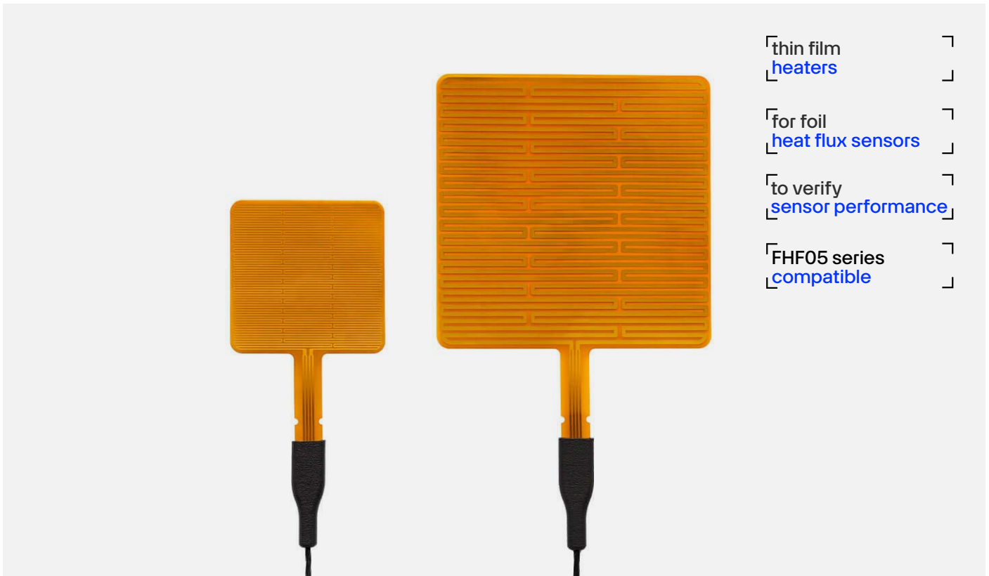
Figure 1 Models HTR02-50X50 (left) and HTR02-85X85 (right) heaters.

HTR02 heaters are so-called "foil heaters." They can be used in combination with foil heat flux sensors, such as the FHF05 series, for testing purposes or as a general-purpose heater.