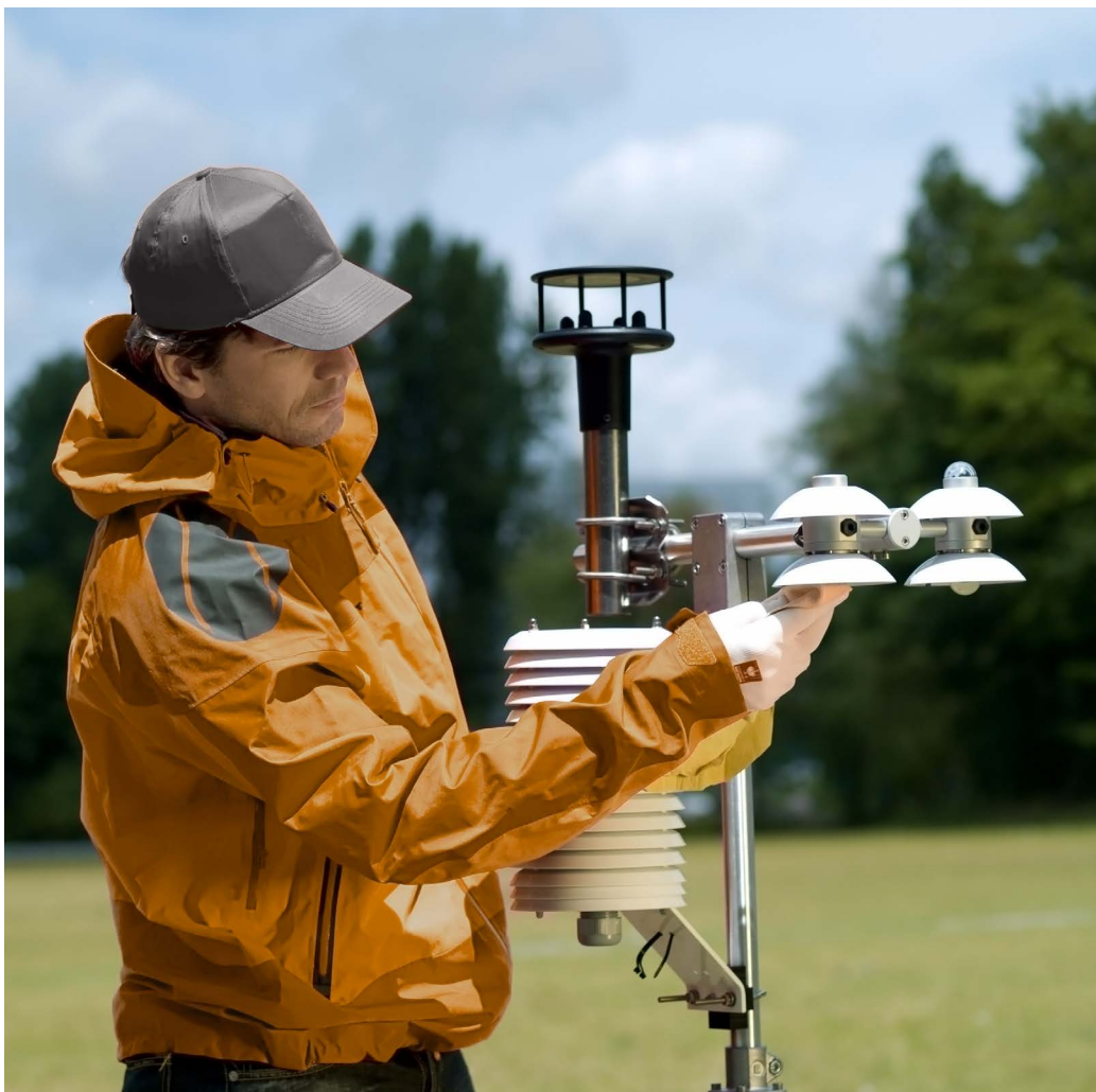
Figure 2 HFP01SC is used in soil heat flux measurements in high-accuracy surface energy flux experiments.

HFP01SC calibration is traceable to international standards. The factory calibration method follows the recommended practice of ASTM C1130