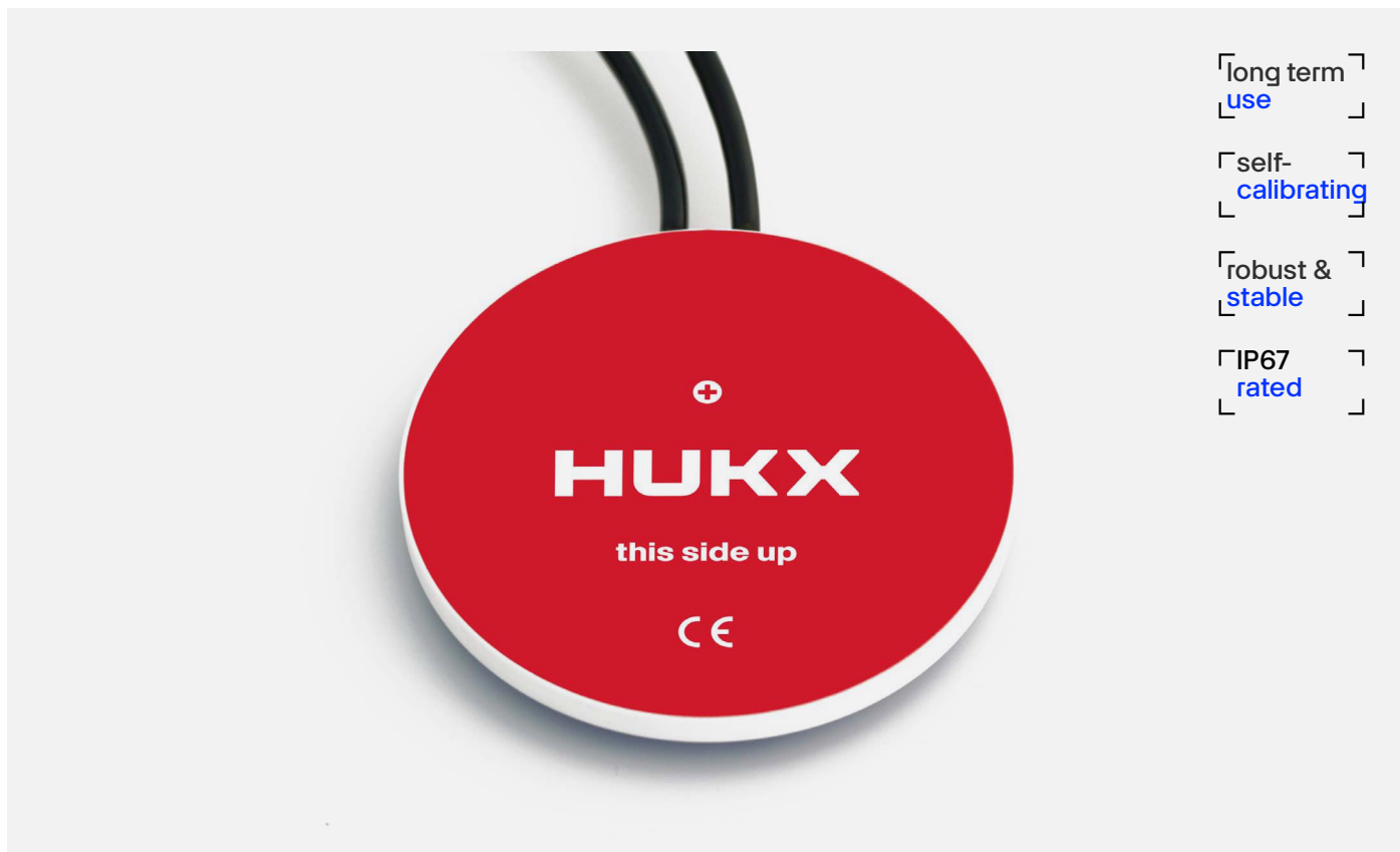
Figure 1 HFP01SC self-calibrating heat flux sensor. The opposite side has a blue coloured cover.

The self-test results in a verification of sensor contact to the soil and in a new sensitivity that is valid for the circumstances at that moment. The latter is called self-calibration. Implicitly also cable connection, data acquisition and data processing are tested.