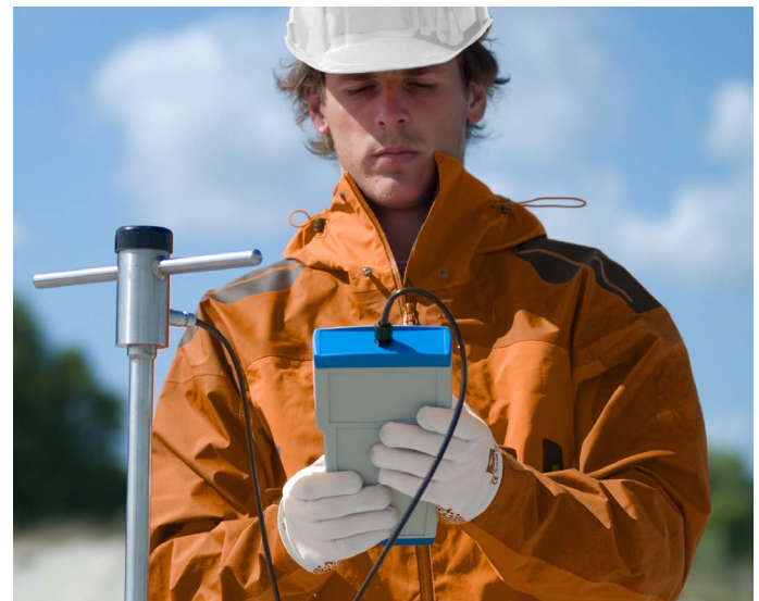
Figure 3 FTN02 being used in an on-site (field) survey.