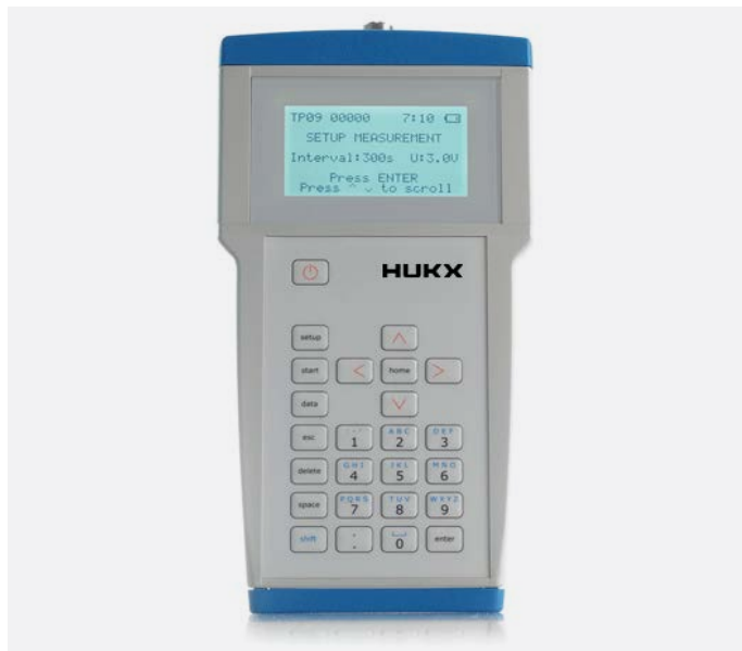
Figure 5 FTN02: CR02 control and read out unit.

For laboratory use, FTN02 may be combined with a shorter and thinner sensor mounted on a short insertion tool (MTN02). See system TNS02 .