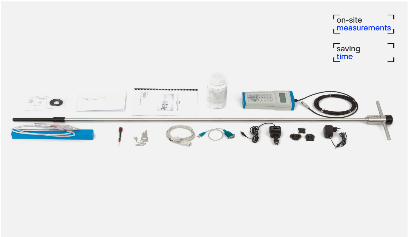
Figure 1 FTN02 thermal needle system

The measurement method is based on the use of a "thermal needle", also called Non-Steady-State Probe (NSSP) technique. This method employs a heating wire and a temperature sensor in a needle.