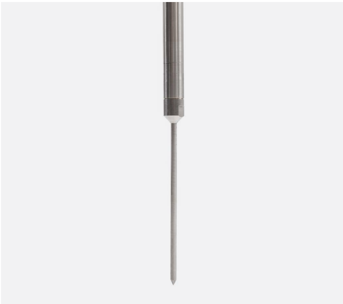
Figure 4 FTN02: robust TP09 needle mounted on LN02.