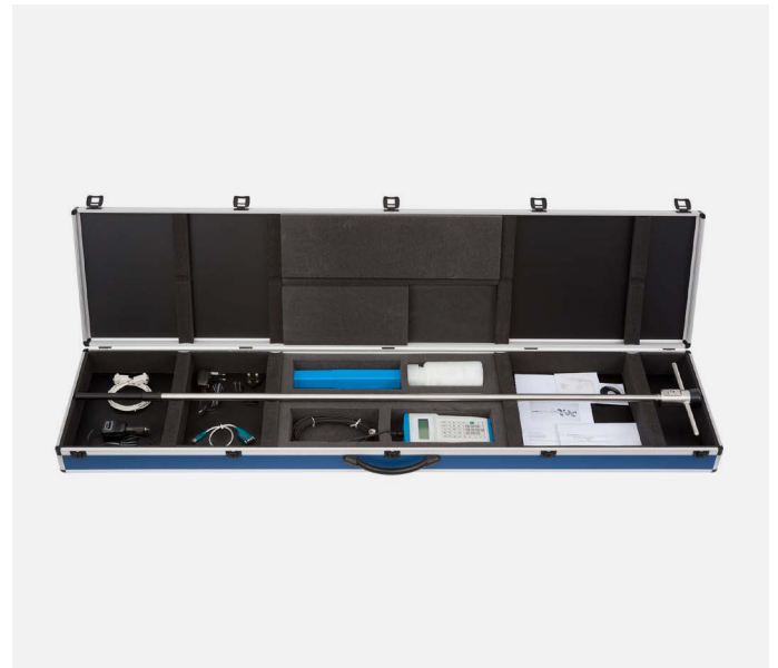
Figure 6 The complete FTN02 system: FTN02 includes one spare sensor TP09, adapters for charging the system in the office, WSA02, and in an automobile, CA02. Also included are communication software and a jar for glycerol. Glycerol must be purchased locally.